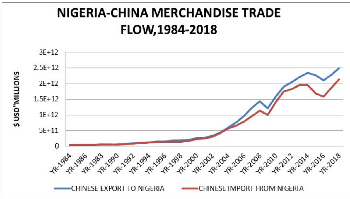
Figure 1: A Trend of Nigeria-China Merchandise Trade Inflow, 1984-2018